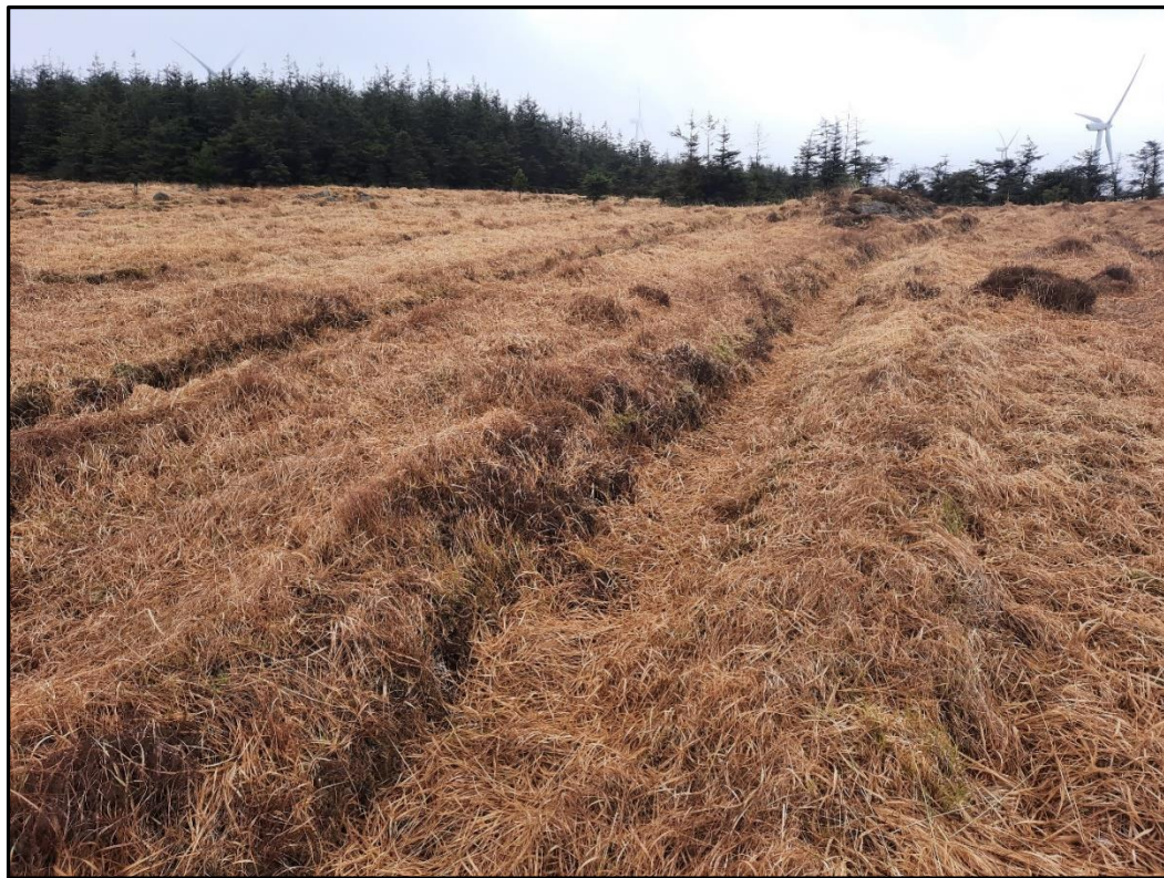
Plate 2. Views of old forestry drains within the proposed restoration area.