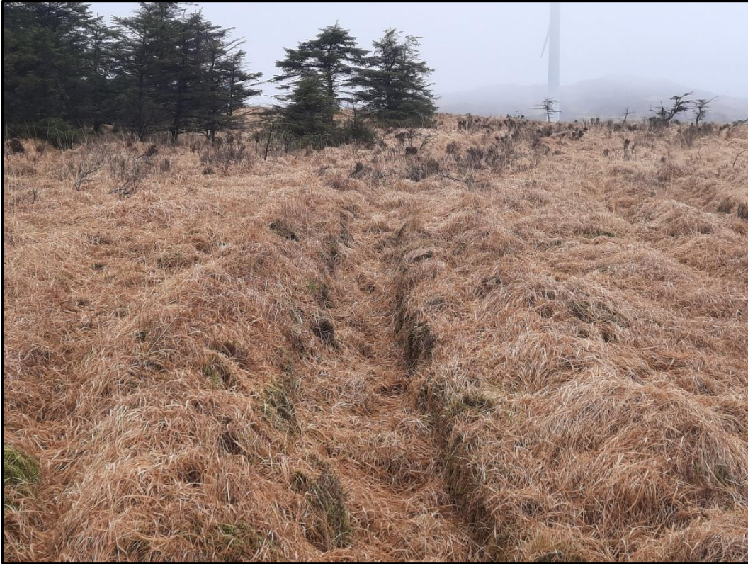
Plate 1. Old forestry drain in the peatland rehabilitation area.